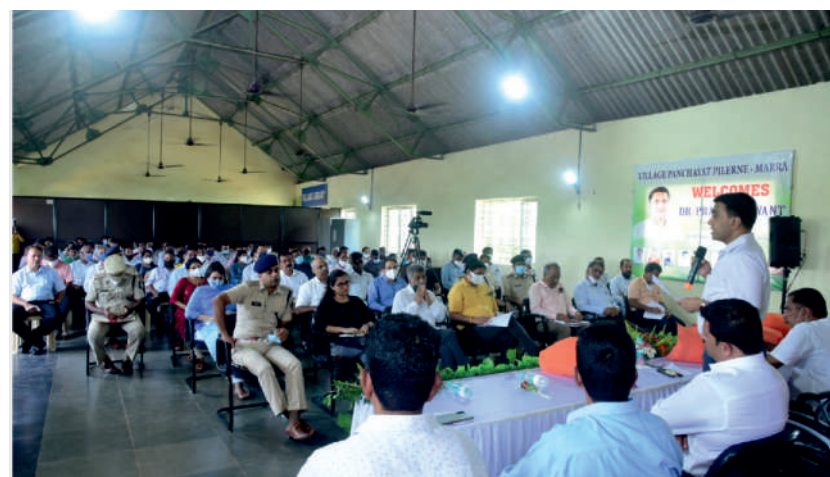
Chief Minister Dr. Pramod Sawant interacting with the Swayampurna Mitra's & Officers at Panchayat Hall, Pilerne