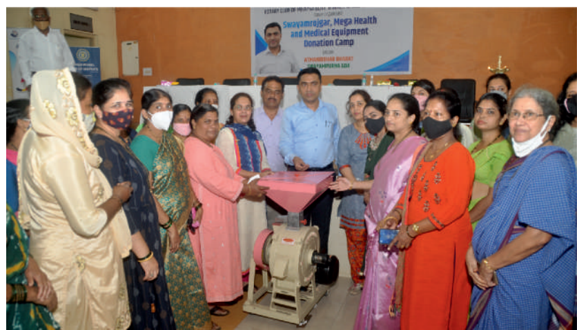
CM, Dr. Pramod Sawant at Swayamrojgar, Mega Health and Medical Equipment Donation Camp under Swayampurna Goa by Rotary Club Mapusa